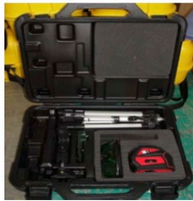
Big BMC c/w Tripd